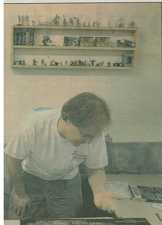
While playing the newest edition of "Dungeons &

years, he runs a group called "The Core Rulebook" which boasts 100 members and hundreds look like other players.